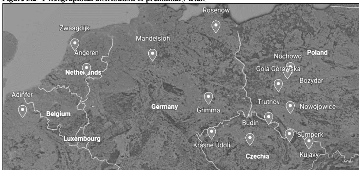
Figure 3.2--1 Geographical distribution of preliminary trials

The table below summarizes the efficacy data found in Appendix 3 of the BAD.